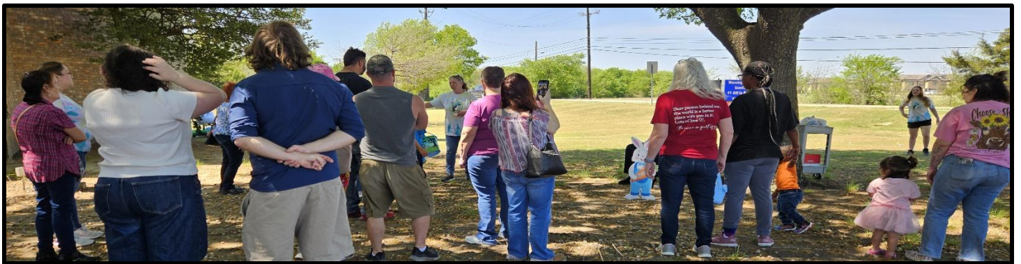
Many people from the community watching their kids find Easter eggs!