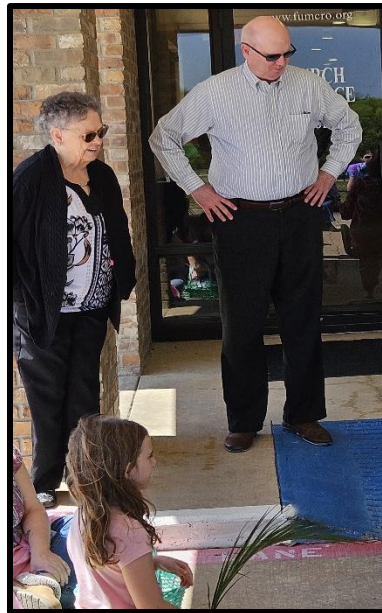
Listening to the Easter story!